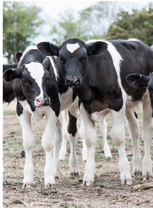
CALVES CONFINED TO SMALL CRATES ARE MORE LIKELY TO HAVE IMPAIRED LOCOMOTOR ABILITY THAN CALVES RAISED OUTSIDE IN GROUPS.