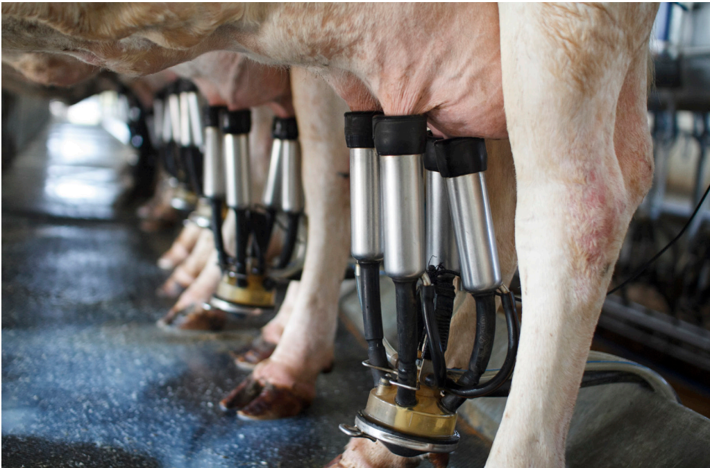
THE USE OF GROWTH HORMONES IN DAIRY CATTLE HAS BEEN ASSOCIATED WITH SEVERAL HEALTH CONDITIONS AND PREMATURE SLAUGHTER IN OLDER COWS.