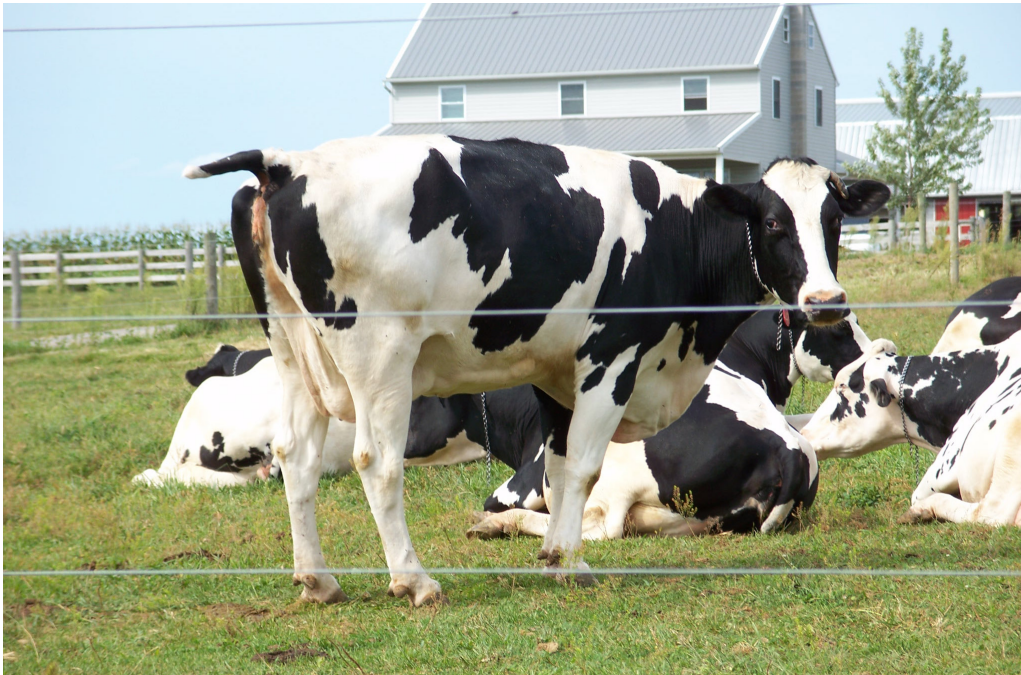
CATTLE WITH DOCKED TAILS MAY EXPERIENCE PAIN AS A RESULT OF NEUROMA FORMATION IN THE TAIL STUMP.